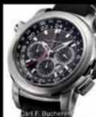
Carl F. Bucherer