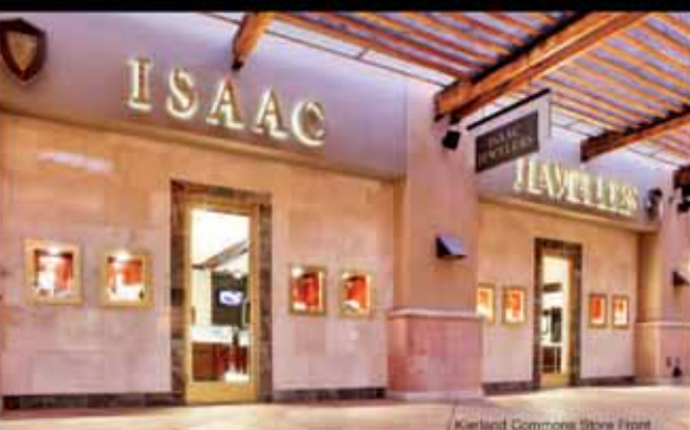
Kierland Commons Store Front