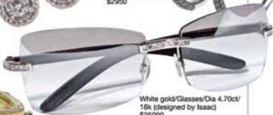
White gold/Glasses/Dia 4.70ct/ 18k (designed by Isaac) $25000