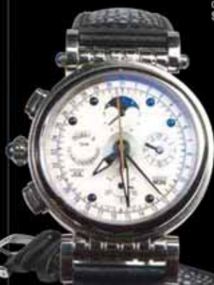
Dubey&Schalderbrand/ spiral/limited #87 $16950