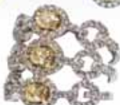
House of baguette/Ring/ .77ct wht dia/.86ct yellow/18k $9330