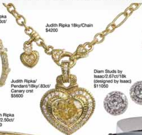
Judith Ripka/ Pendant/18ky/.83ct/ Canary crst $5600