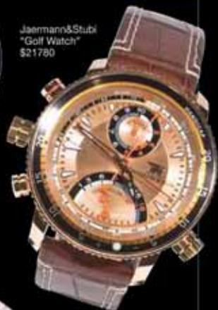
Jaermann&Stubi "Golf Watch" $21780