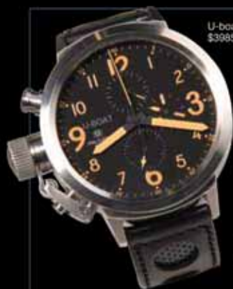
U-boat 50mm $3985