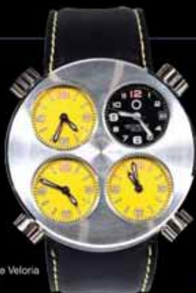
Meccaniche Veforia 45mm zone $5500