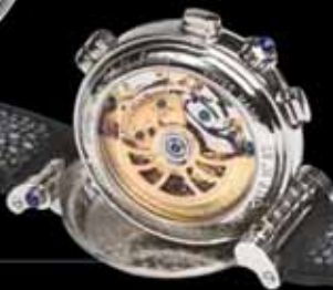
Dunamis watches 13.40ct $42000